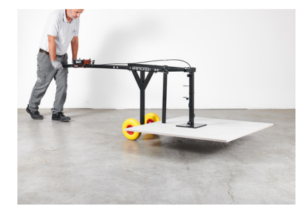
USE WITH CART

TSX can be used with its cart to allow one-person usage. With two large wheels 10-inches in diameter made of solid rubber perfect for going over rough surfaces.